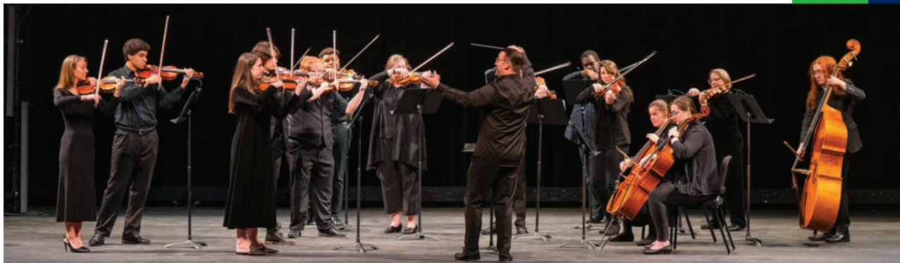
MTSU Chamber Orchestra