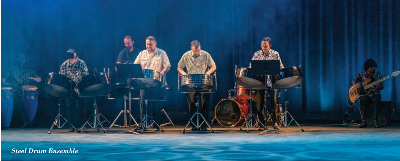
Steel Drum Ensemble