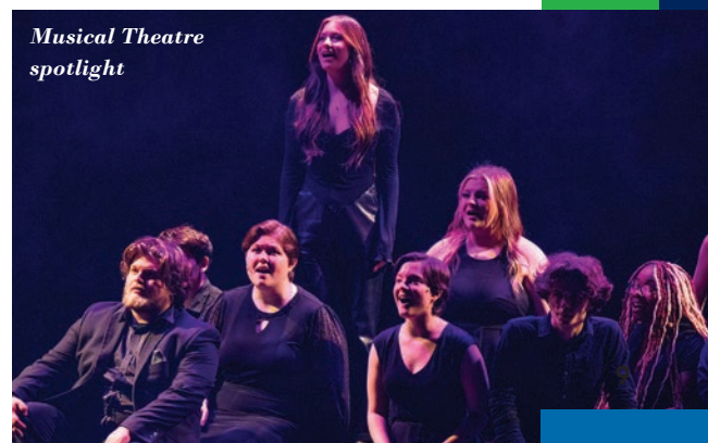
Musical Theatre spotlight